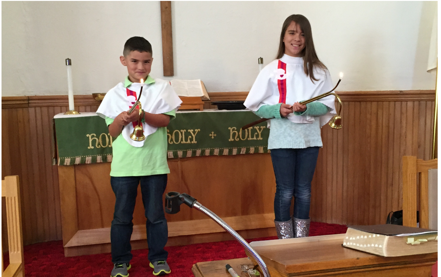
Justice and Sydney helping with the service and showing off their new Acolyte robes

Estancia United Methodist Church P. O. Box 126 Estancia, NM 87016