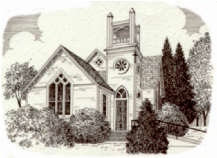
Estancia United Methodist Church, 600 Williams, Estancia, New Mexico