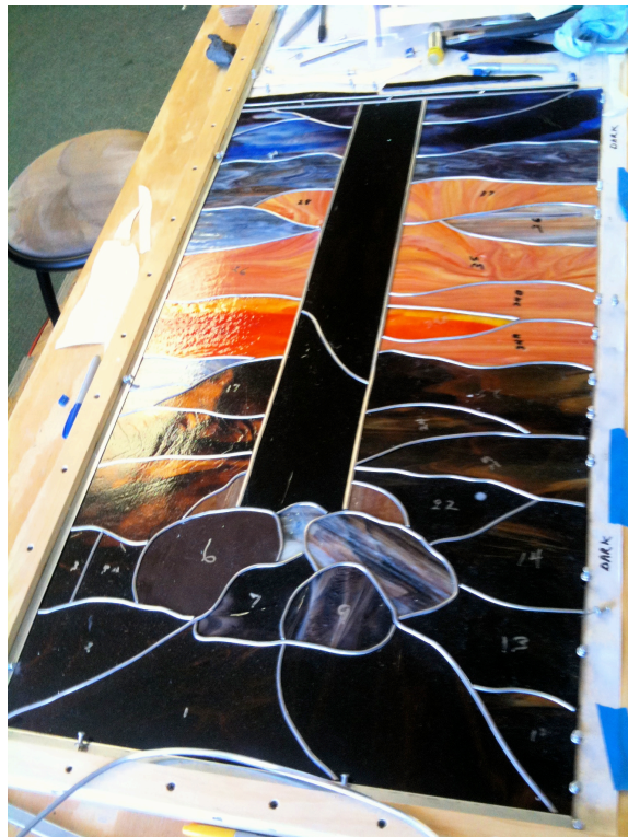
Crucifixion Windows Under Construction