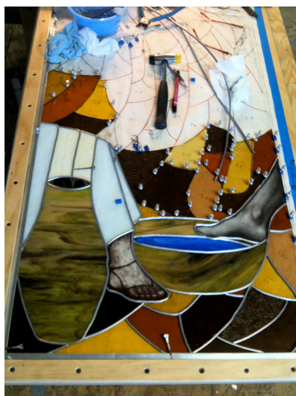
Foot Washing Window