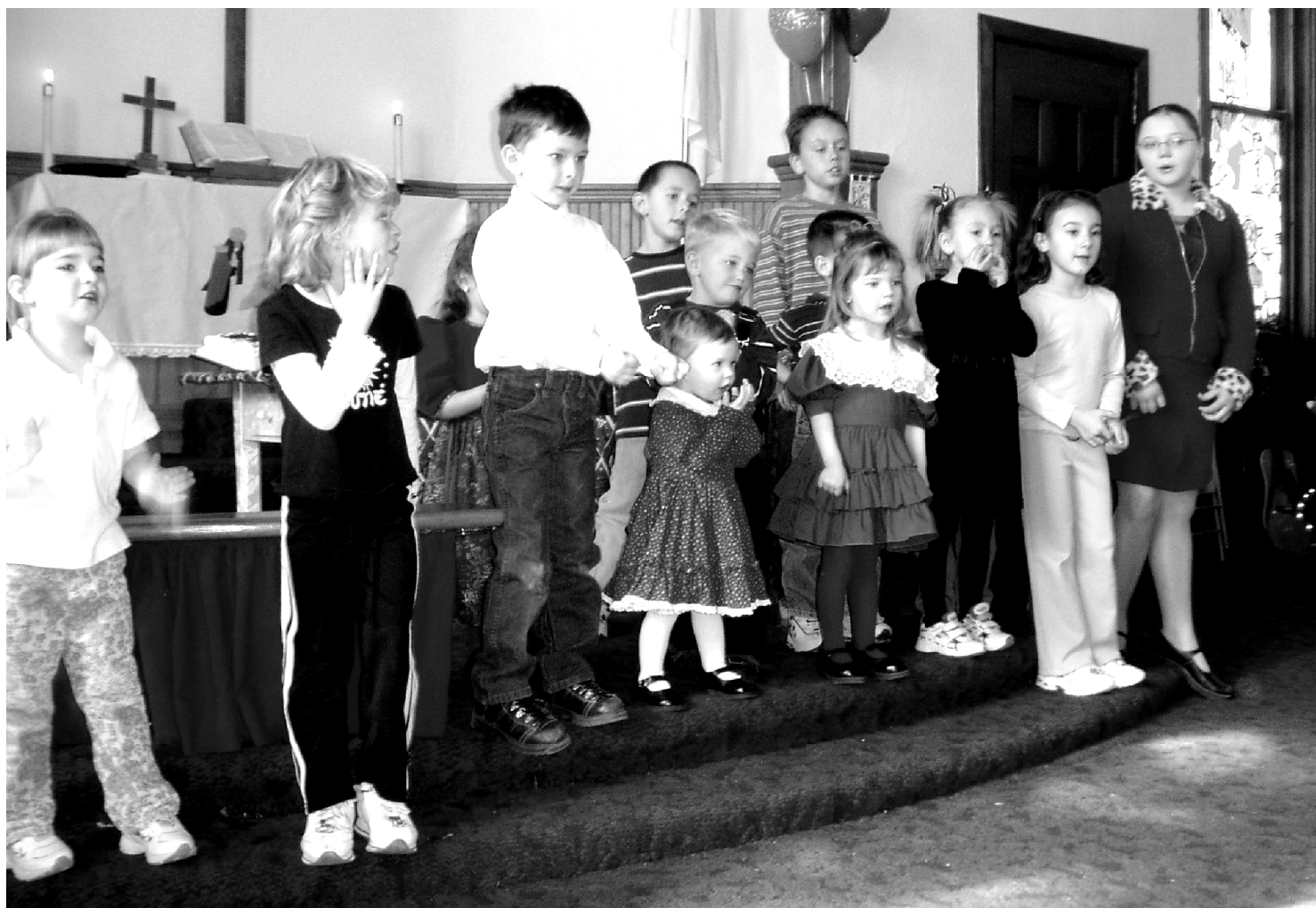
Children's Choir Sings at the Birthday Party for Jesus - Sunday Dec 19