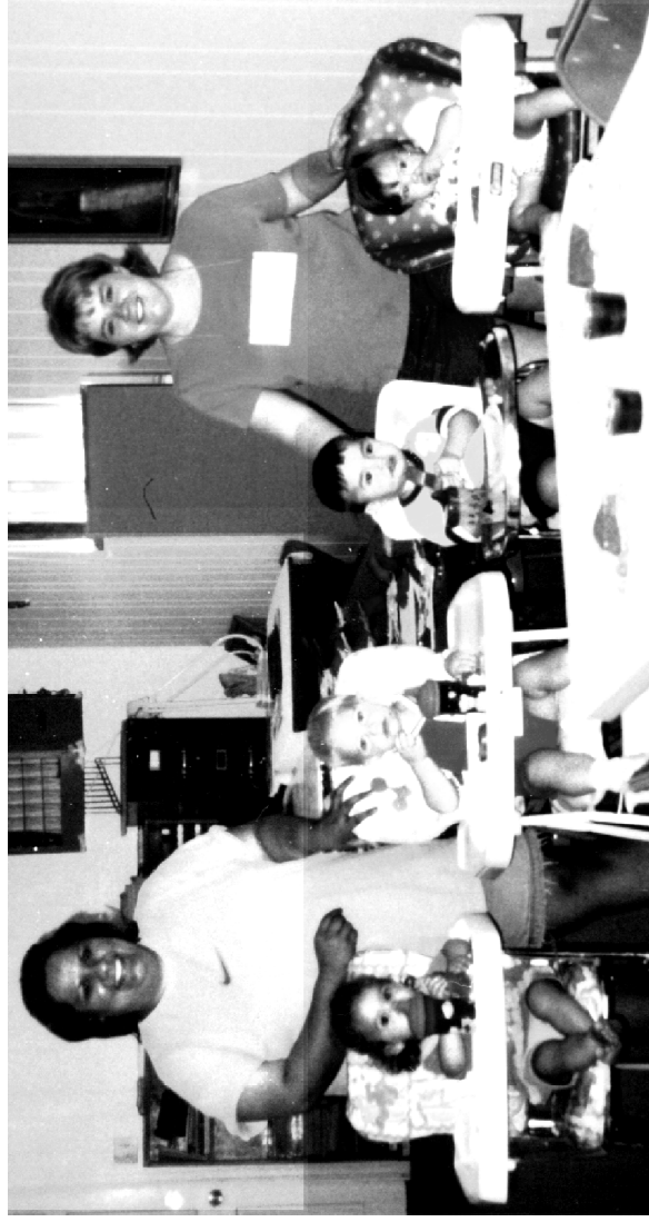
Watermelon Time for the 4 youngest members of VBS