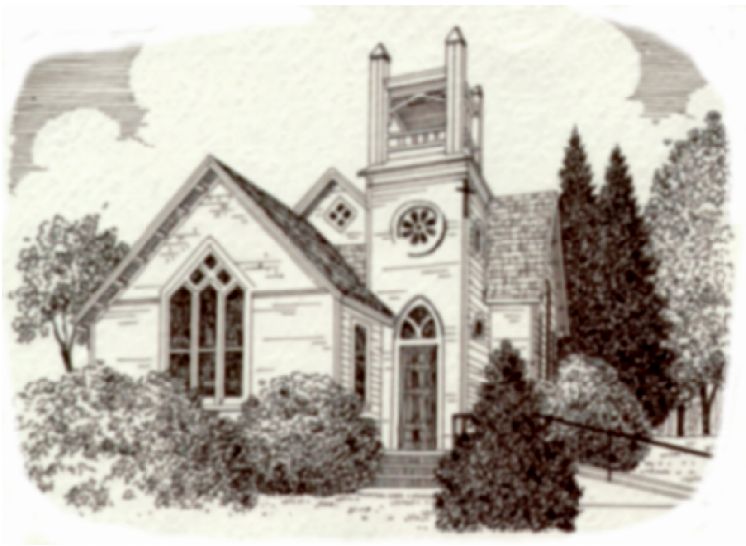
Estancia United Methodist Church, 600 Williams, Estancia, New Mexico

Church School 9:00 AM Sunday Worship 10:00 AM Nursery Provided