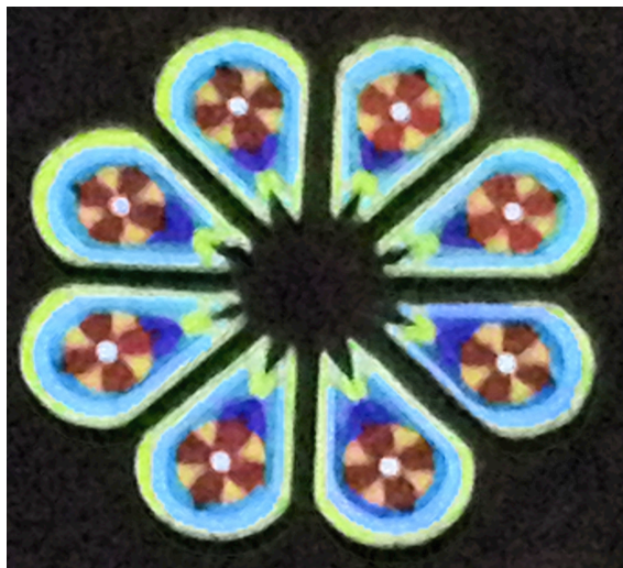
Lighted Bell Tower Windows (Come see them between 8 and 11 PM)