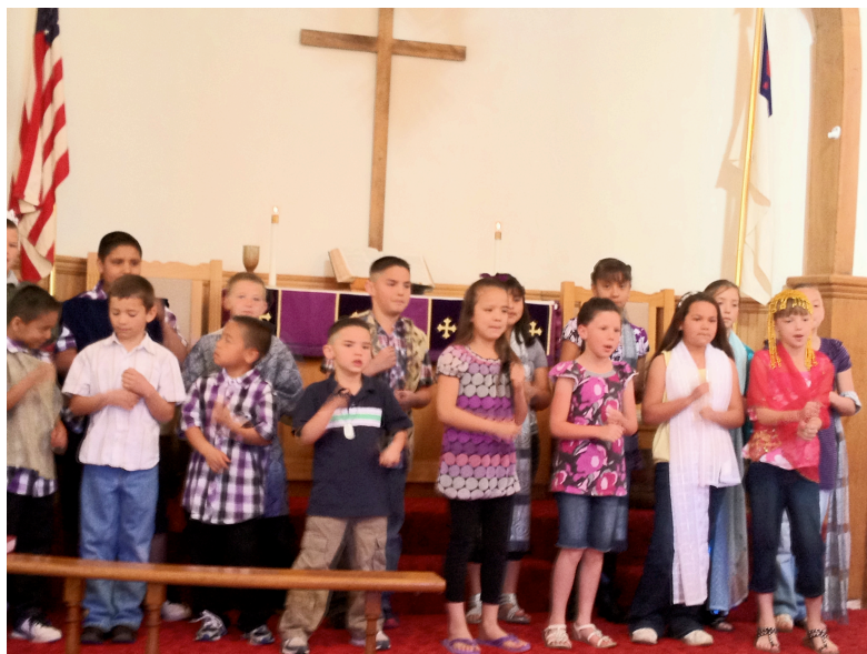
Singing "The Bible"