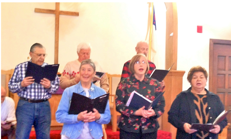
Joyous Singers March 25