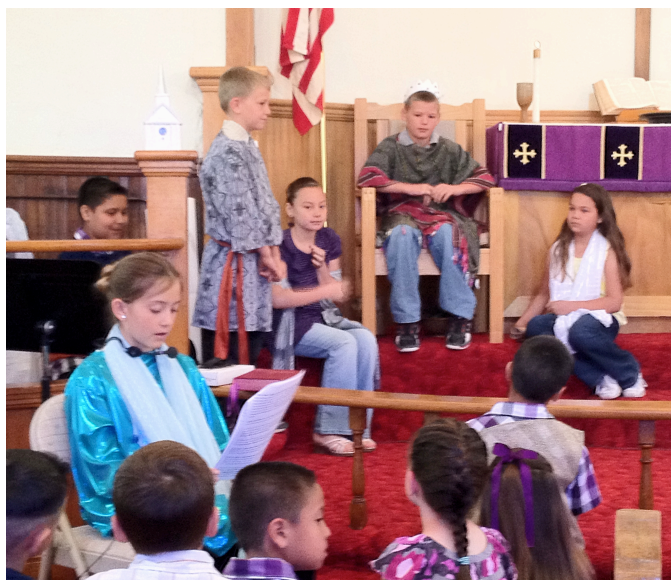
Performing "The Story of Esther"